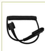
RVM to PDC/PTC series Cable RVM to PD7/9 series Cable RVM to X1/Z1 series Cable