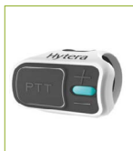
Wireless Ring PTT