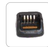
MUC Rapid-rate Charger