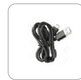
Data cable PC143