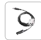
Programming cable PC155