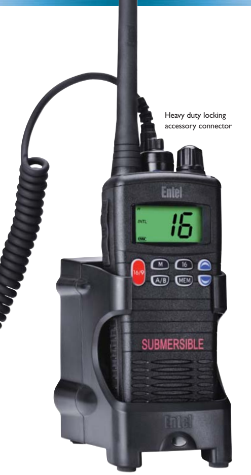
Pictured: Radio with optional CSAHT rapid charger

HT Marine Series 2.0 – superseding the multi award-winning HT series 1.0 is a challenging task considering its success with fire brigades, petrochem, shipping and major blue chip organisations worldwide. Version 2.0 builds upon this success with a wider range of models to suit every application from simple to advanced. Built to last, the HT Series 2.0 is designed to endure the every day rigours of life at sea.