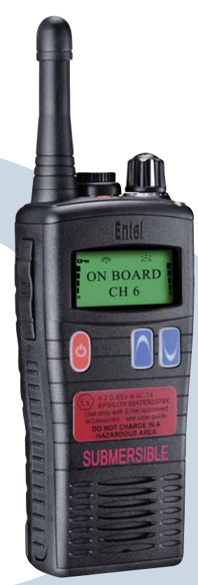
Pictured: UHF ATEX variant with stubby antenna

Zone 2 covers areas where the environment is only rarely hazardous, and then only for brief periods.