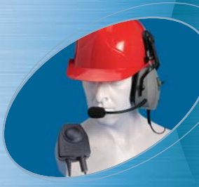
■ CHP750HS ▲ CHP950HS

*Used to charge ATEX models in a non hazardous-environment