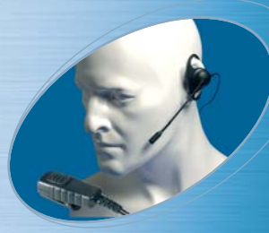
■ EA19/750 ▲ EA19/950